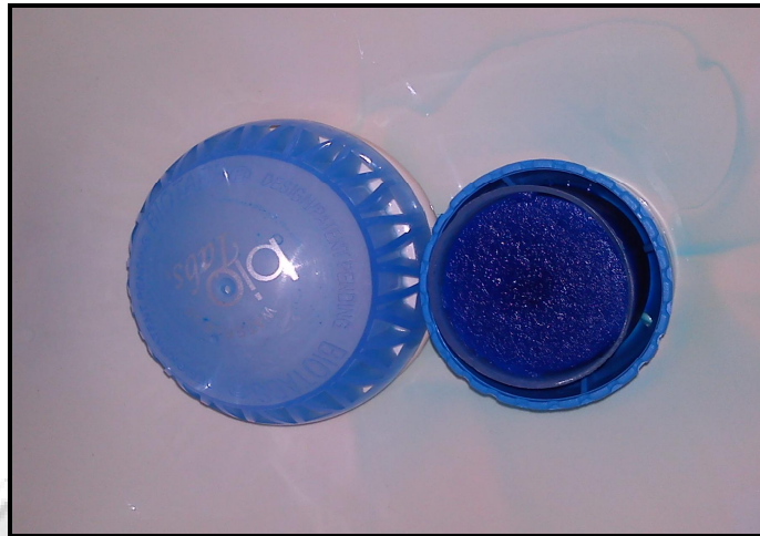
Result after 30,000 cycles of Endurance Test